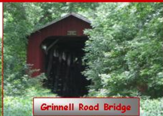
Grinnell Road Bridge