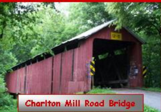
Charlton Mill Road Bridge